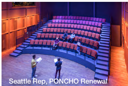
Seattle Rep, PONCHO Renewal

Since our founding in 1944, Sellen has been fortunate to work with many of the most impactful arts and nonprofit institutions in the Pacific Northwest. We adopt the mission of our clients as our own and empower our employees to participate in their communities throughout the region.