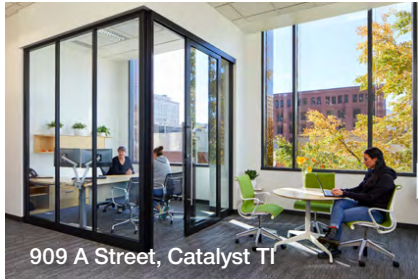
909 A Street, Catalyst TI

Sellen has successfully completed more than 25 million square feet of fast-paced interior office projects in recent years. Our crews deliver tenant improvement work in many of Seattle and Bellevue's most prominent high-rise towers, ranging in size from a few hundred square feet to multiple floors.