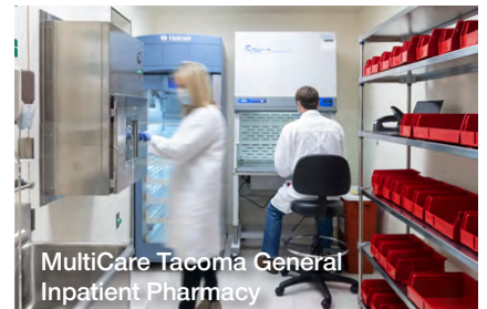
MultiCare Tacoma General Inpatient Pharmacy