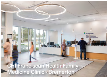
CHI Franciscan Health Family Medicine Clinic - Bremerton